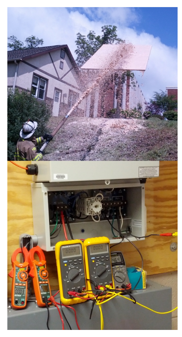
Fig. 1: Top - application of foam to array. Bottom - measurement procedure.

difficult. Most importantly, this procedure requires firefighters to ascend to the roof of a burning building, which is generally not recommended.